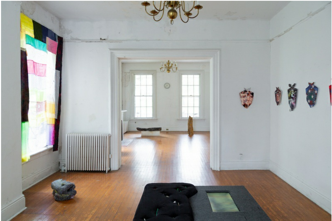
Installation view: Transient Grounds , 2021, Governors Island, NY.